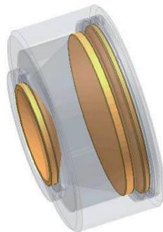
1 | A doublet, with protective window

The new ZSD-15 series doublets contain ZnSe elements made from the same laser grade ZnSe and fully coated with low absorption anti-reflection coatings. They are capable of handling high powers whilst focusing down to smaller spots and with lower F-theta errors.