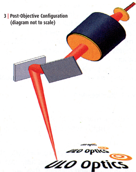
3 | Post-Objective Configuration (diagram not to scale)