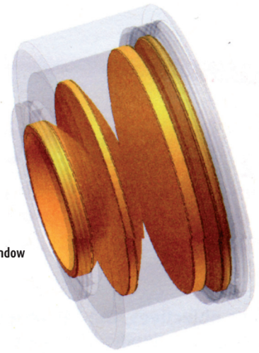
2 | A triplet lens, with protective window